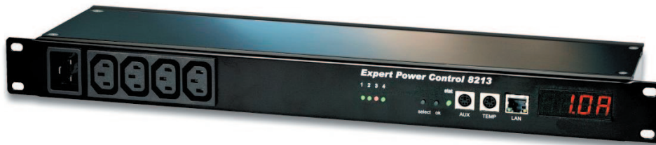
Expert Power Control 8213 Power connectors on front panel